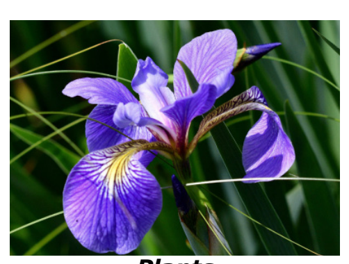
Plants Blue Flag Iris - Dave Alsobrooks