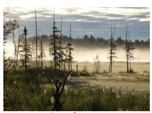
Landscape Fall Morning - Laura Gasaway